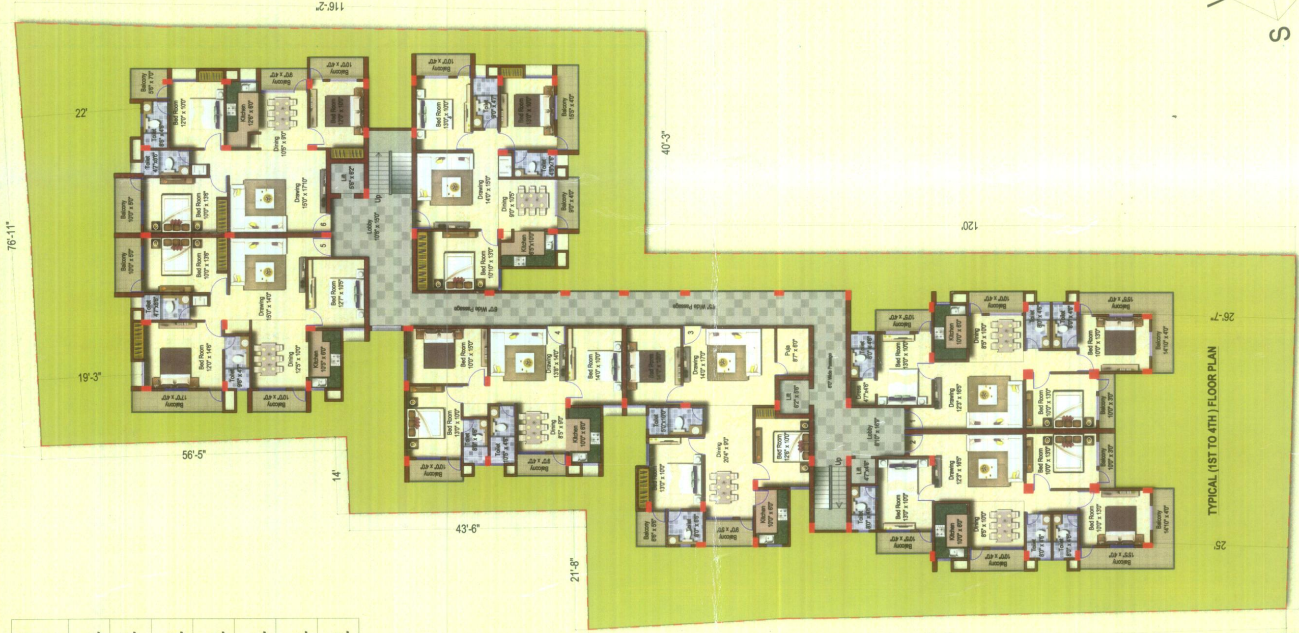
TYPICAL (1ST TO 4TH) FLOOR PLAN