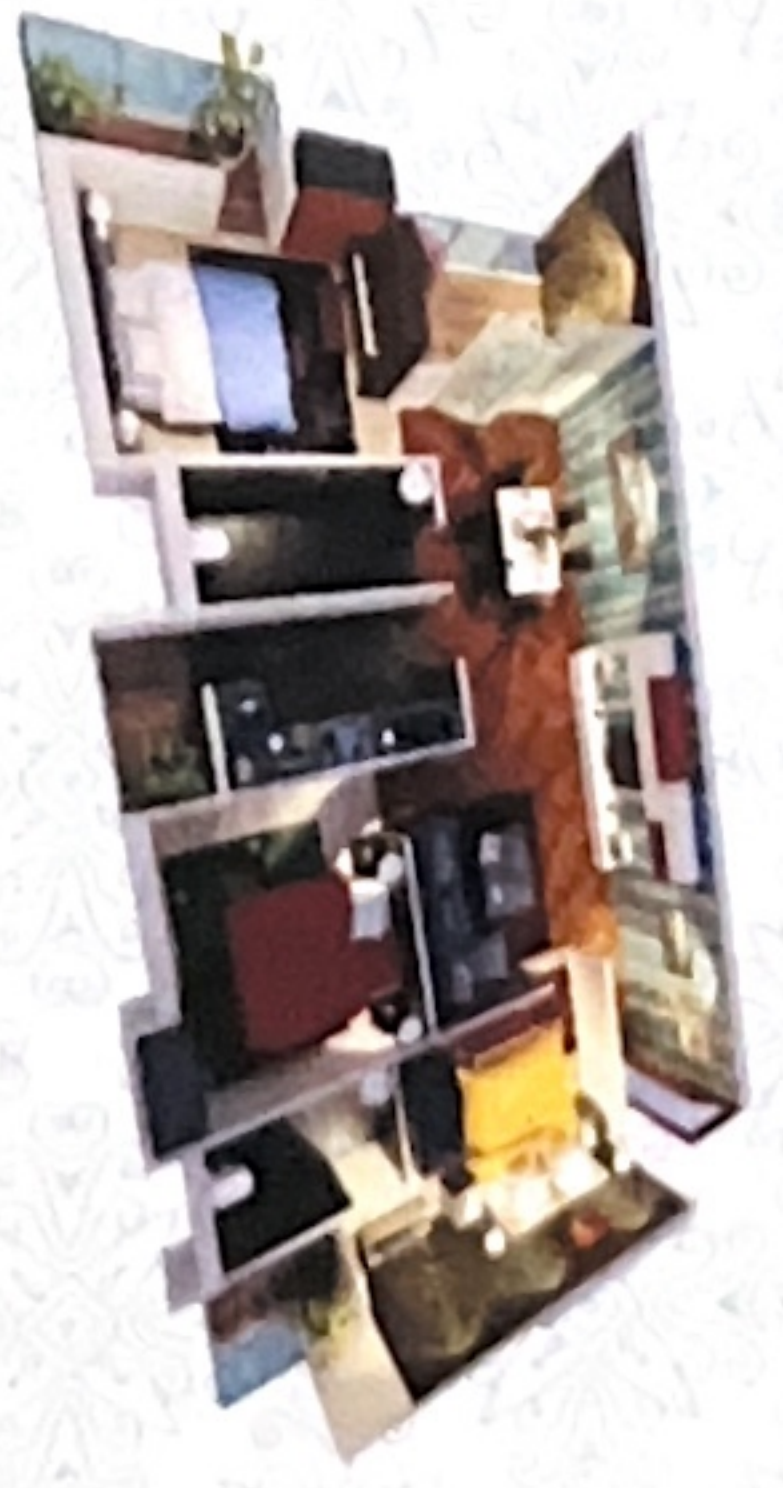
FLAT - 4 (2 BHK) S.B.U.A.- 1313 SQ.FT.