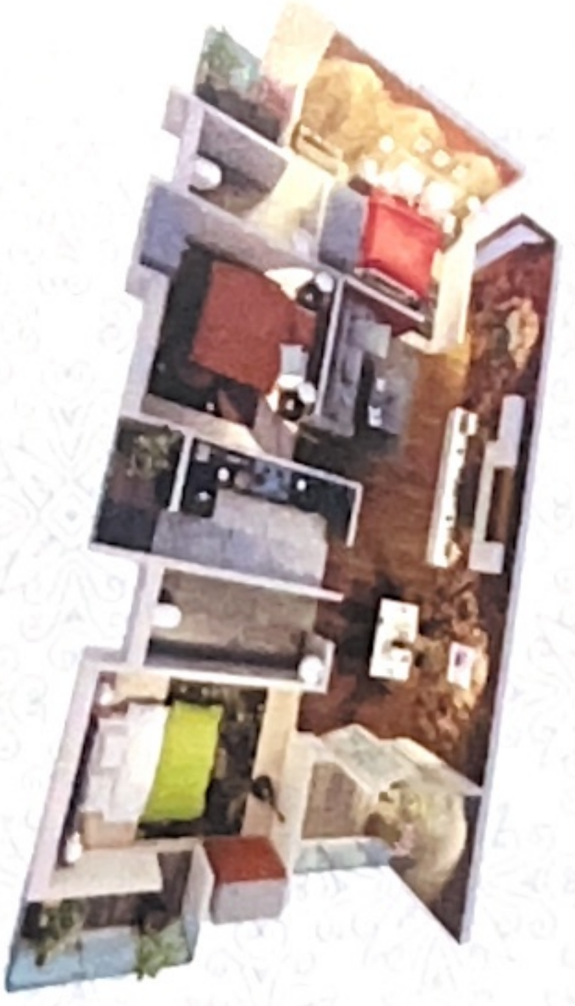
FLAT - 3 (2 BHK) S.B.U.A.- 1313 SQ.FT.