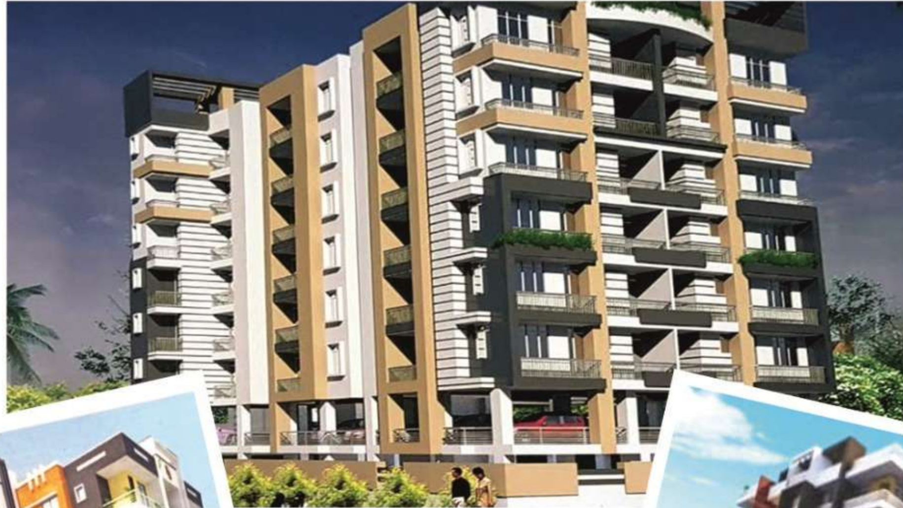
GAURI DEV RESIDENCY