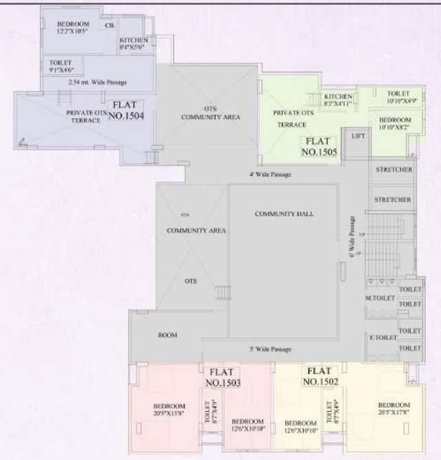
15TH FLOOR PLAN