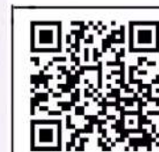
SCAN FOR LOCATION