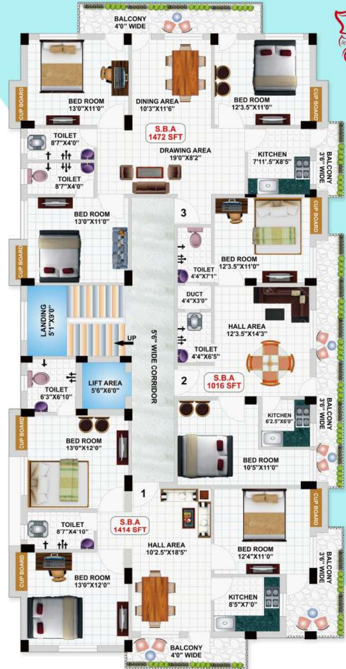
1ST TO 3RD FLOOR TYPICAL FLOOR PLAN