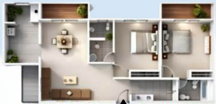
FLAT - 5 (2BHK) 105, 205, 305, 405 S.B.U. - 1368 SQ.FT.