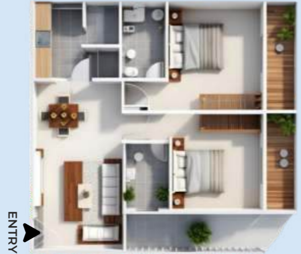
FLAT - 4 (2BHK) 104, 204, 304, 404 S.B.U. - 1221 SQ.FT.