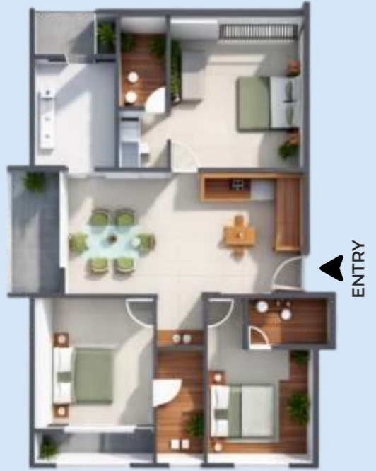
FLAT - 1 (3BHK) 101, 201, 301, 401 S.B.U. - 1770 SQ.FT.