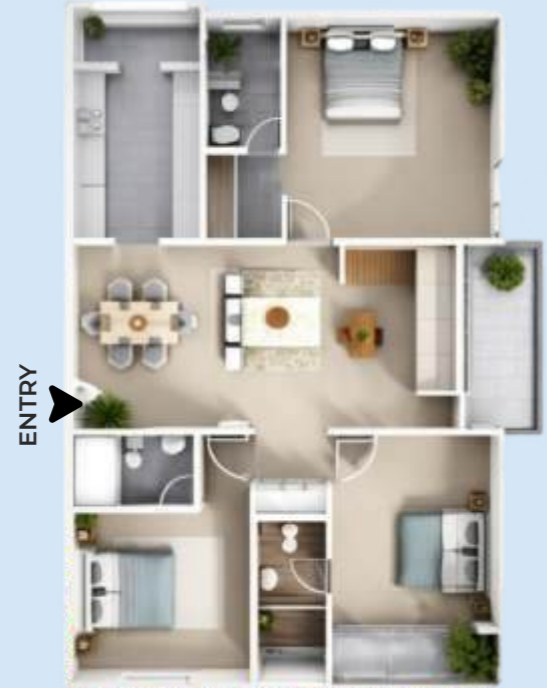
FLAT - 2 (3BHK) 102, 202, 302, 402 S.B.U. - 1805 SQ.FT.