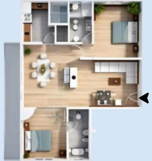
FLAT - 3 (2BHK) 103, 203, 303, 403 S.B.U. - 1368 SQ.FT.